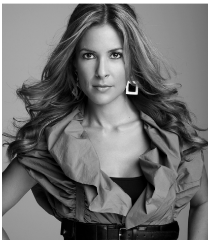
Dina Pugliese - Host of Breakfast Television